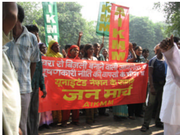
AIKMM Protest against waste-to-energy plants

POSCO's plant, which also includes a captive power unit and a port, is the single largest foreign direct investment in the country yet. The clearance was given with 60 additional conditions, 28 for the steel plant and 32 for the captive port, but these are seen as unlikely to be high obstacles for the Korean promoters.