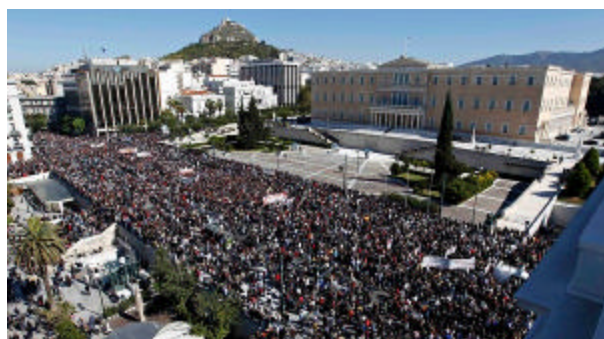
Hundred thousands of Greeks protest Austerity measures of the government.

The protest turned violent when members of PAME (All Workers Militant Front), affiliated to the WFTU, were violently attacked by hooded goons while the police stood and watched. About 100 people were hospitalised with injuries.