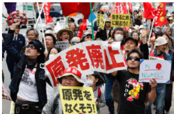
Zenroren Rally on May Day in Tokyo. The banner in the centre reads "Abolish nuclear power plants."

The agricultural workers' union, Unite, called the demonstration to try to persuade MPs to oppose both the inclusion of the AWB in the Bill and the entire Public Bodies Bill. The opposition Labour Party is committed to maintaining the AWB. The demonstration was followed by a meeting in the Parliament where MPs were invited to meet with rural workers to hear from them directly how the abolition of the AWB would impact on their lives.